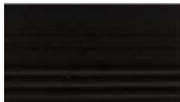
113-2S Class I Dark Bronze Anodized