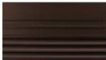
112-2S Class I Medium Bronze Anodized