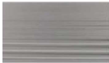
215-R1 Class I Clear Anodized