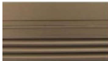
111-2S Class I Light Bronze Anodized