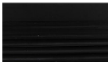
115-2S Class I Black Anodized